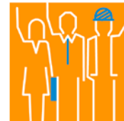
Employment and Industrial Relations