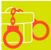
Combating Bribery, Bribe Solicitation and Extortion